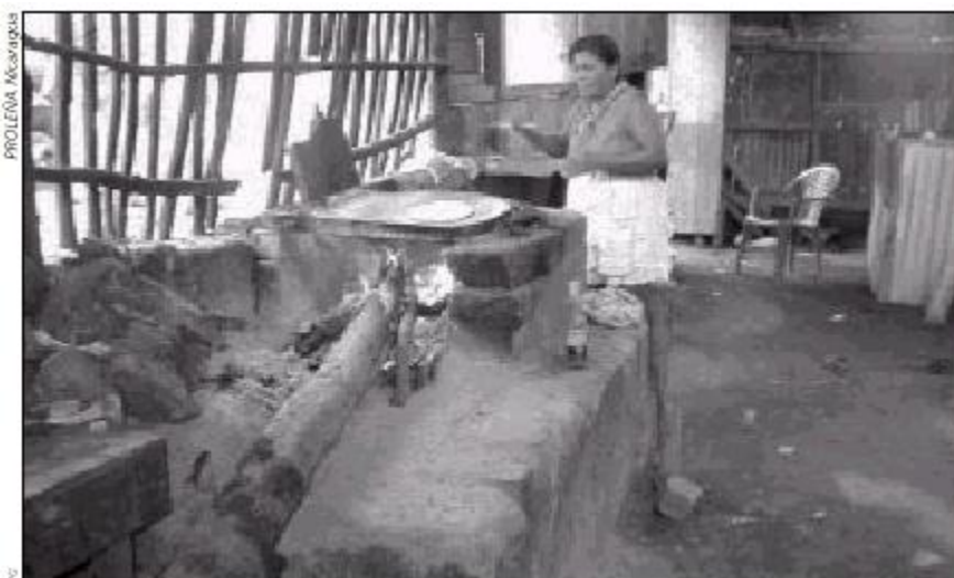
Figure 1: Cooking on a highly inefficient stone stove

The EcoStove is an innovative woodstove which basically is a vented and insulated stove. The fire is entirely enclosed within the firebox (a ceramic elbow) which, in addition, is placed within a box of insulated material such as pumice rock. Above the fire there is a plancha (a large griddle metal) which is heated firstly by the flames and secondly by the