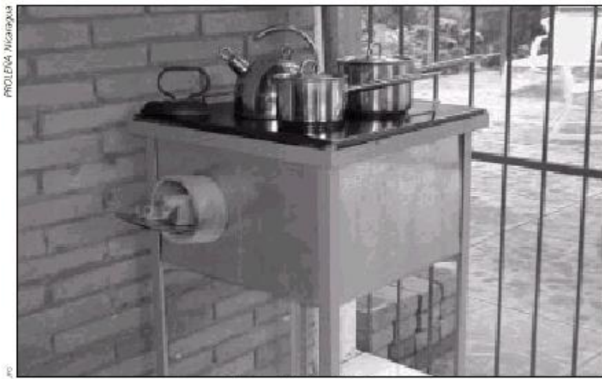
Figures 2.1: The EcoStove